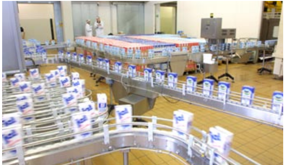
From the UHT-production the products reach ...

Due to the best-before date period of only seven days, the entire goods handling in the fresh dairy products area is carried out within 24 hours. The UHT-milk with a longer best-before date period however is stored for at least three days before delivery for quality control in the com-