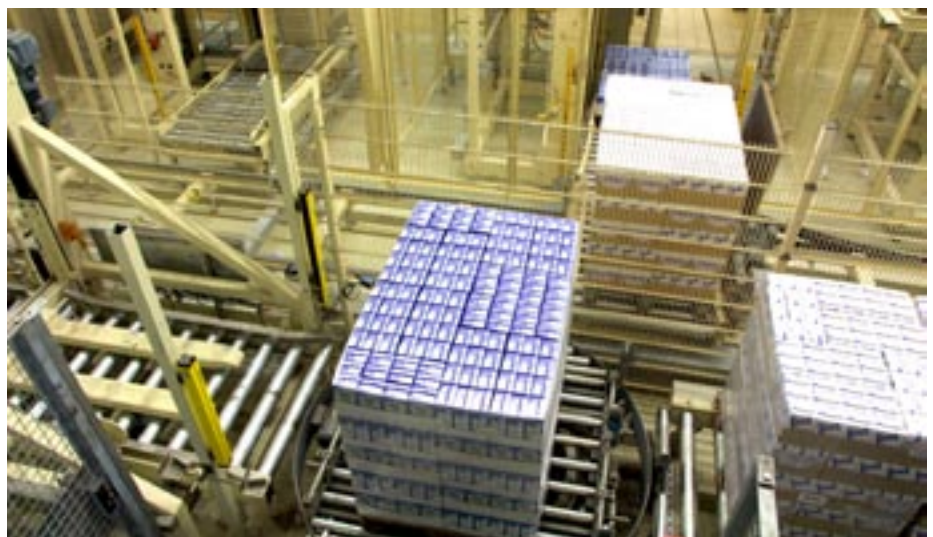
... the palletizing places in order to be stored in the high bay warehouse.

with comparable standard software. The entire SRD were created on the basis of only three workshops. After the client's approval, the basic version of the LFS 400 was completed according to the project requirements after modular conception with existing elements and the software was adapted to the client-specific requirements. After only six months, the software implementation was completed.