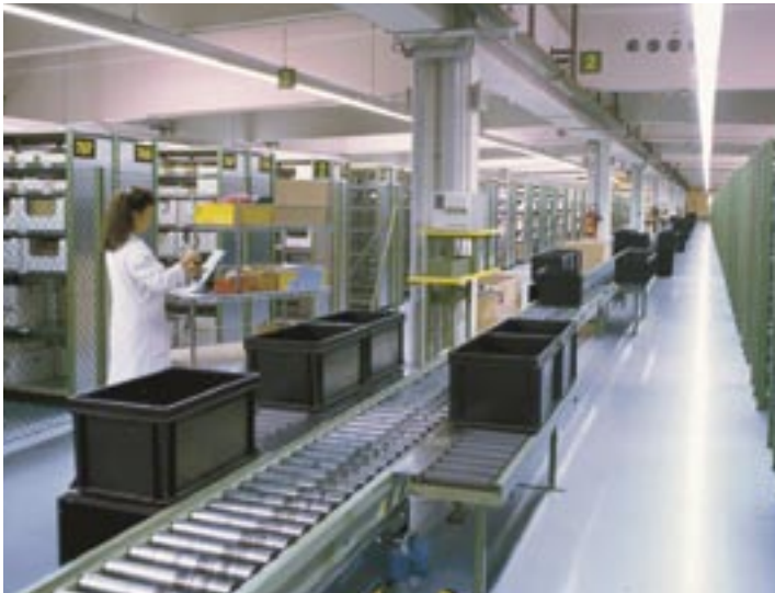
A 99 percent inventory accuracy is guaranteed by permanent cycle count and cycle count by level zero

700 positions are currently received daily to be able to meet with order demand.